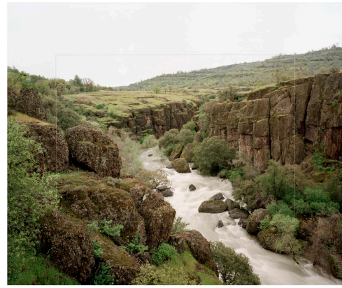
April 8, 2006. High water on Big Chico Creek. Near Salmon Hole, Upper Bidwell Park, Chico, Ca.